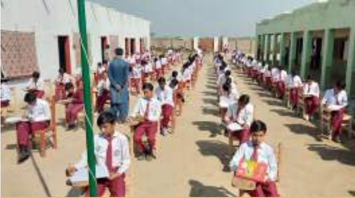
Assessment Mock Activity in schools, purpose of the mock activity was to check and prepare the students for upcoming assessment by SEF on February 12, 2020