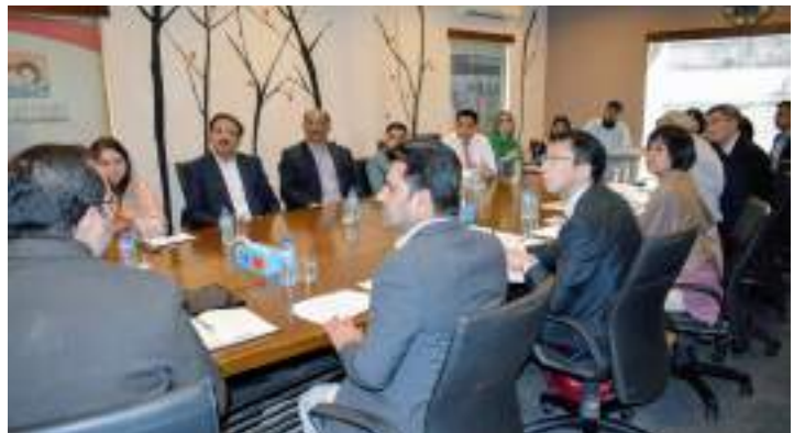
Meeting with the delegation of JICA is underway to discuss the NFE Curriculum-at SEF head office, Karachi on February 18, 2020