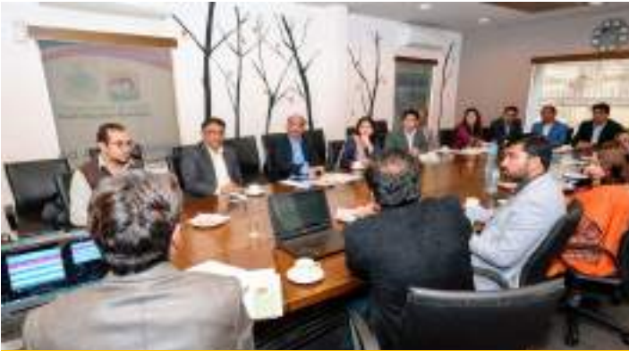
To review the progress of SEF Regional team, a meeting with SEF management was conducted at head office with regional team on January 16 and 17, 2020