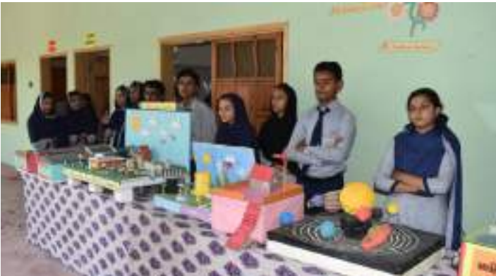
An inauguration of Science and Art Exhibition Ceremony was arranged at newly established Fine Future Public School at Shahpur Chakar, Sanghar, on February 26, 2020