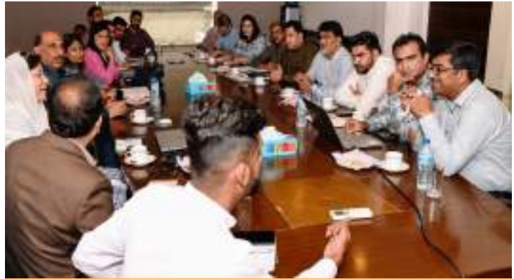
Sukkur IBA - meeting with SEF management regarding assessment on March 03, 2020: