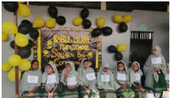
'Spelling Bee' competition and quiz competition observed at SEF assisted Babul Islam School Karachi on January 06, 2020