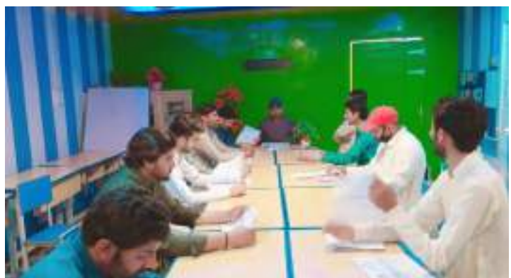
SEF regional teams are preparing for assessment orientation in Sukkur, January 09, 2020