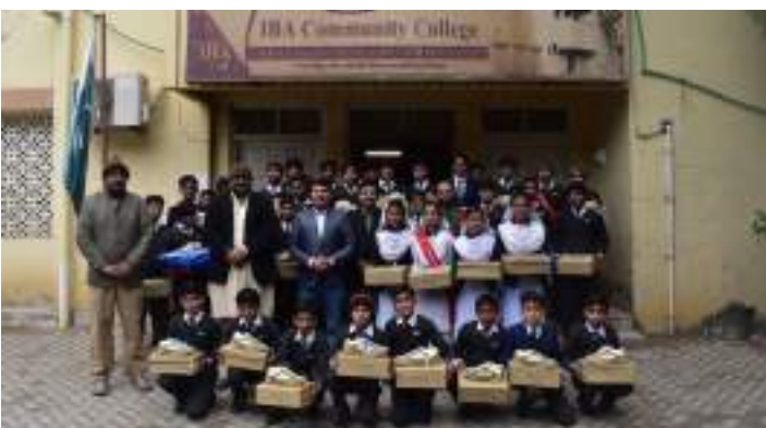
Winter sports shoes distribution among SEF Scholars of SESP Phase-I & II at IBA Community College Dadu on January 07, 2020 at IBA CC Dadu supported