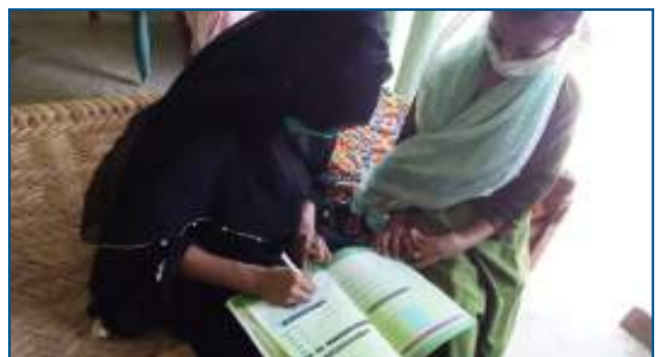
AALTP staff from Gorakh, Johi, Dadu and Mahar visited learner's homes for homework follow-up and collected home-work feedback with strictly followed SoPs, June 2020