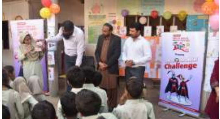
SEF in collaboration with Colgate Pakistan conducted teeth cleaning awareness sessions at different Foundation (SEF) Assisted Schools of Dadu Region on February 17, 2020