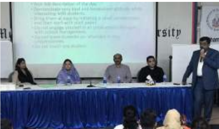
Invigilator's orientation has been organised by SUKKUR IBA who are assessment invigilation/execution partners of SEF at Muhammad Ali Jinnah University Karachi, March 2020