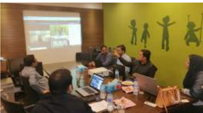
Sindh Education Foundation and Microsoft initiated an Education Readiness Workshop for SEF educators during March 2020